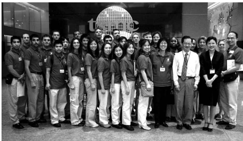
Taiwan Semiconductor Manufacturing Company hosts SJSU College of Engineering Asia Study Tour delegation at TSMC headquarters in Taiwan.