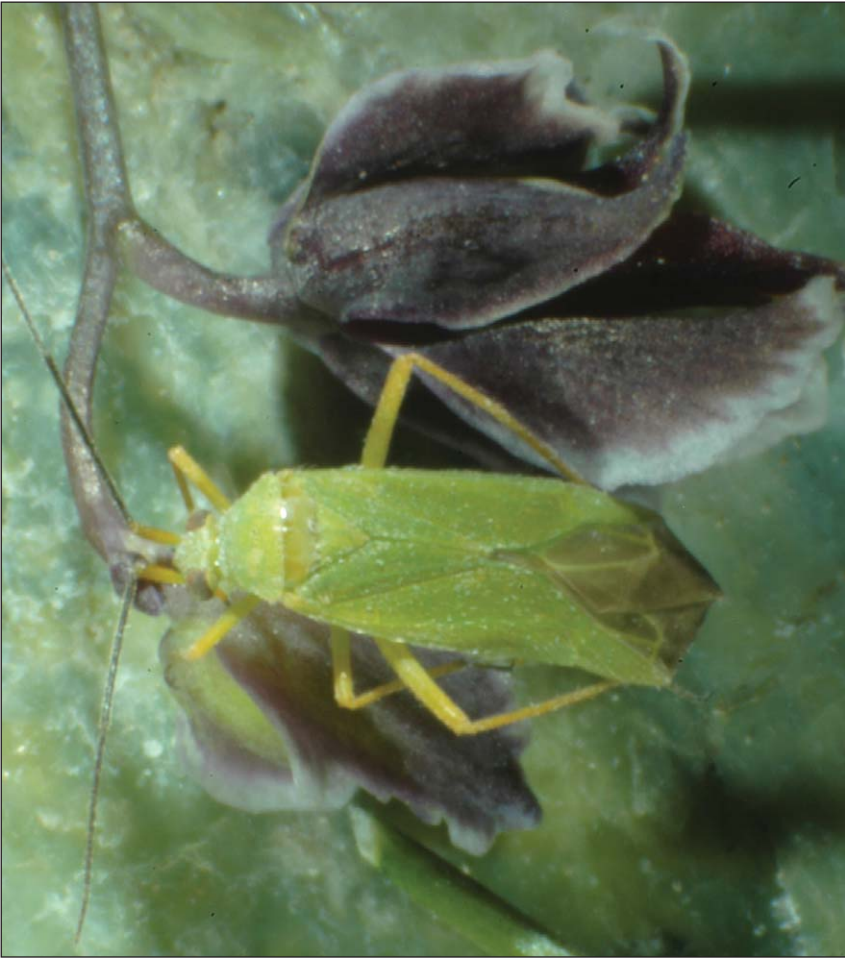
Figure 1. Adult form of the mirid bug Melanotrichus boydi , found only on serpentines in the foothills of California's Sierra Nevada.

Future investigations that add to our knowledge of the serpentine biota are sorely needed. Basic inventories are lacking for many relatively neglected groups of organisms (e.g., bryophytes, insects, lichens, nematodes, protists), and new species likely await discovery in these groups. As an example, Figure 1 and the cover of this Special Issue show photos of Melanotrichus boydi Schwartz and Wall, a new species of mirid bug described in 2001 that is found only on serpentines in the foothills of California's Sierra Nevada (Schwartz and Wall 2001). This species is one of the first discovered "high-nickel insects," species with relatively high levels of Ni in their tissues that are currently known only from serpentine sites (Boyd 2009). Of course, additional information is needed even in better-studied groups, such as the vascular plants, and in relatively well-studied regions such as North