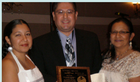
Center for Mexican American Studies honored by NACCS. We thank CMAS for their support of this conference, NACCS, and for 35 years in continuing the efforts to build Chicana and Chicano Studies!