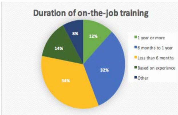
Figure 2. Duration of on-the-job training for CSIs in the United States.