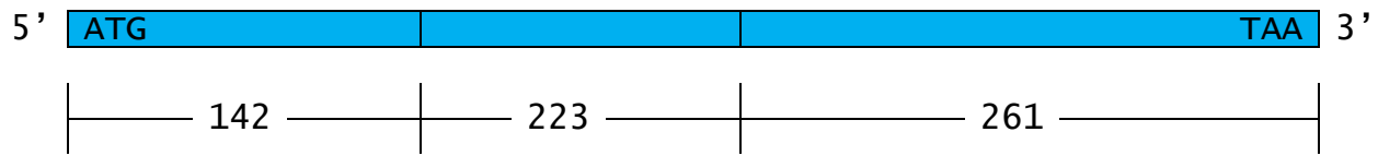
Figure 3.1: length of HBB's coding sequence