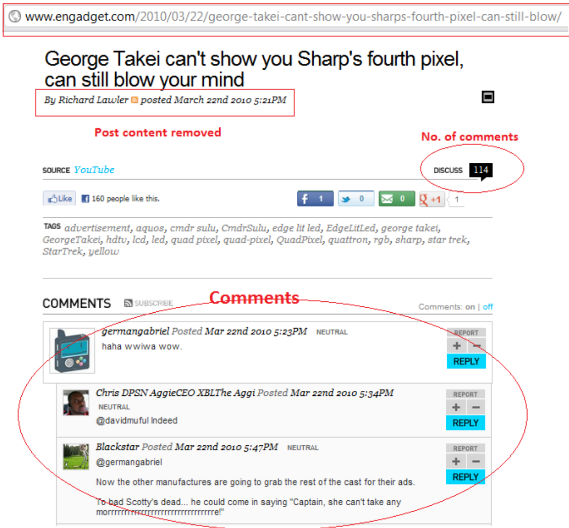
Figure 5: Cropped blog post (ID 11335) with influential factors and comments

Figure 4 & Figure 5 depict cropped blog posts with post_ids 12779 & 11335, respectively. As the figures show, we can see the influential factors associated with the blog posts like author name, date of post, number of comments, fblikes, and facebook shares etc. We can also see the comments written by different users.