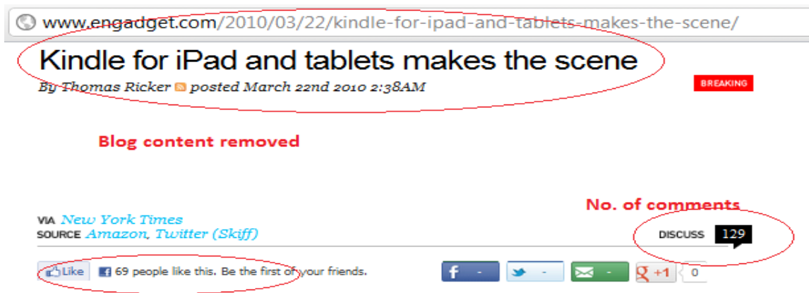
Figure 2: Cropped blog post (ID 14890) with influential factors.

Figure 2 & Figure 3 depict cropped blog posts with post_ids 14890 & 11557 respectively. As showed in the figures, we can see the influential factors associated with the blog posts such as author name, date of post, number of comments, fblikes, and facebook shares etc.