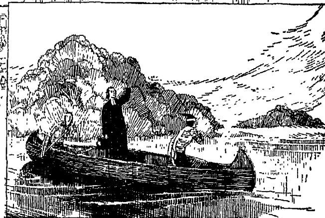
Pere Marquette bringing his message to the Indians of the Mississippi Valley, 1673.

City's History Insures Continued Advancement and Great Opportunities