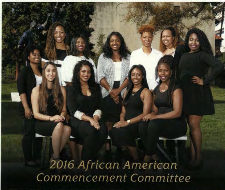
2016 African American Commencement Committee