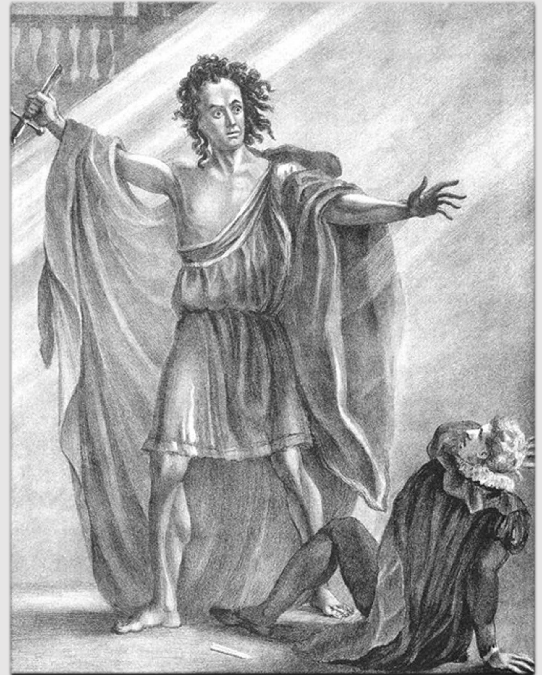
Drawing of T.P. Cook in Presumption . Image portrays freewill. The creature is contemplating on what to do with the sword.