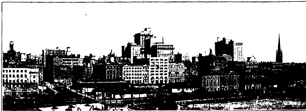
Down Town Toronto, "The Meeting Place," as seen from Lake Front