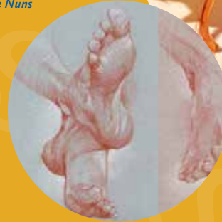
▲ Animation/Illustration feet study