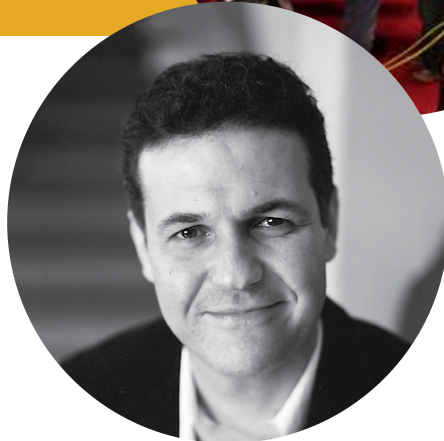
▲ Khaled Hosseini, author of The Kite Runner