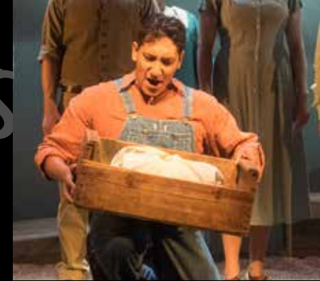
▲ The Grapes of Wrath opera, SJSU

As a Dean, it is vitally important to have discretionary funds that provide seed money to encourage development and execution of such important and impactful collaborations. I am grateful to those who contributed to the DEAN'S LEADERSHIP CIRCLE in the past two years.