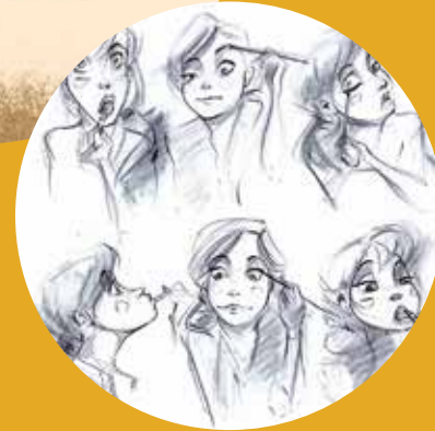
▶ Illustrations by Lauren Jensen featured in Animation/Illustration BFA 2014 Show at Works gallery