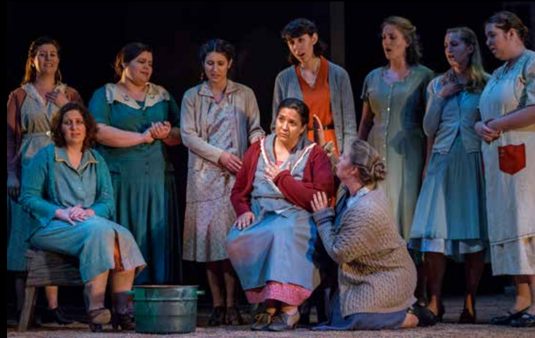
▲ The Grapes of Wrath opera, SJSU