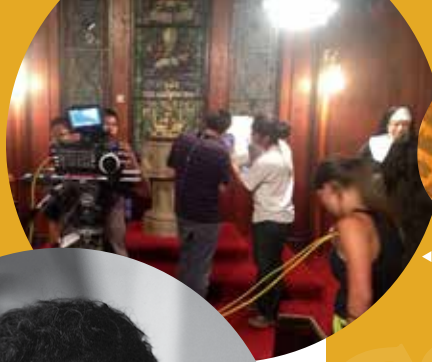
◀ Spartan Film Studios: on the set of summer film Space Nuns