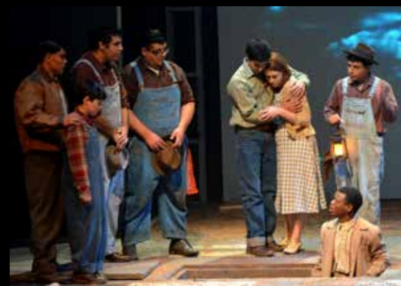
◀ The Grapes of Wrath opera (far left) The Grapes of Wrath play (middle and right)