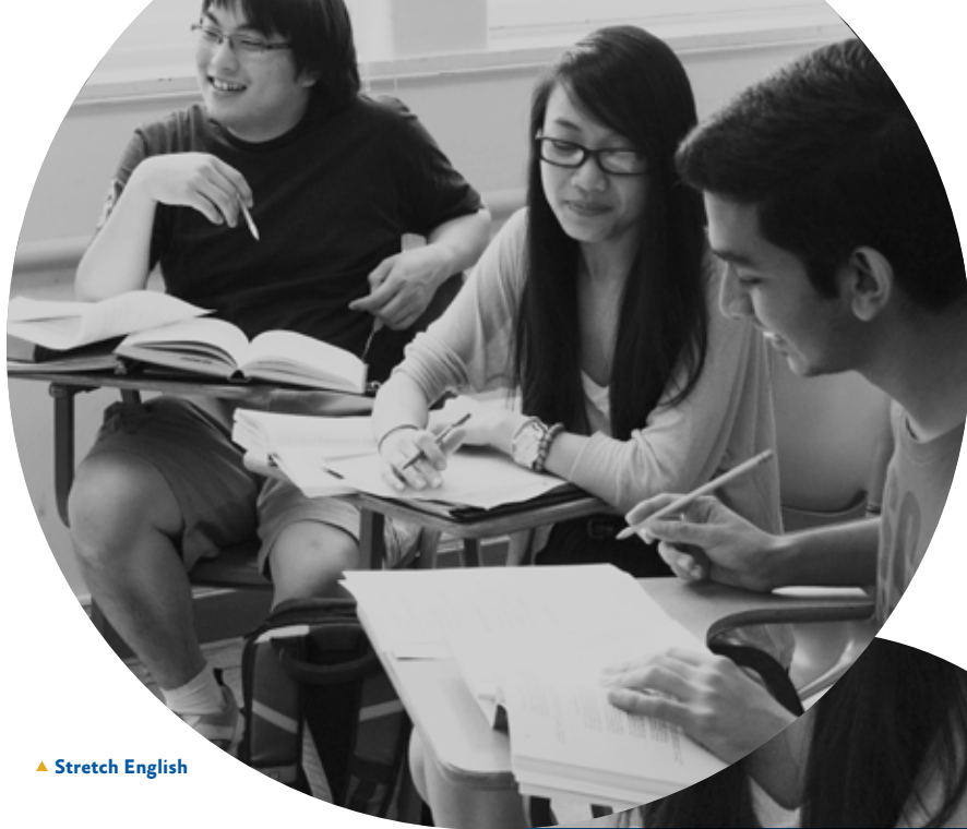
▲ Stretch English