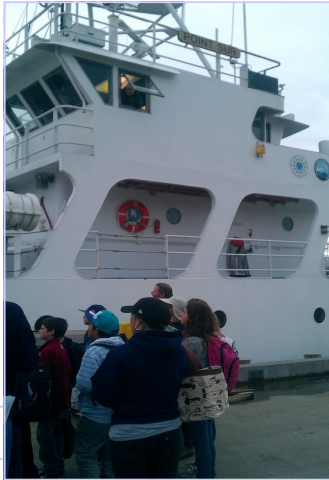
Students embarking Point Sur

Last fall, Moss Landing Marine Labs' research vessel hosted a group of students from Pacific Grove Middle School for a day aboard the Point Sur learning about the ocean's floor.