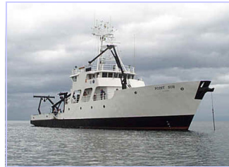
Vessel Point Sur

On November 29, 2012, the research vessel Point Sur began an 8,000 mile expedition to Palmer Station, Antarctica and will return to MLML in May. As of mid-April, researchers were in Mazatlan making discoveries in the Sea of Cortez.