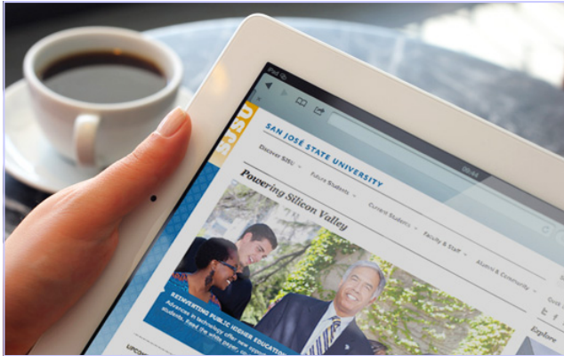
Affordable $150 per course as part of the NexGen education.

S an José State University and Udacity Inc. are developing a pilot program called San José State Plus offering college classes for credit to both SJSU and non-SJSU students. The program began in January 2013 offering classes from an accredited university at a very affordable price.