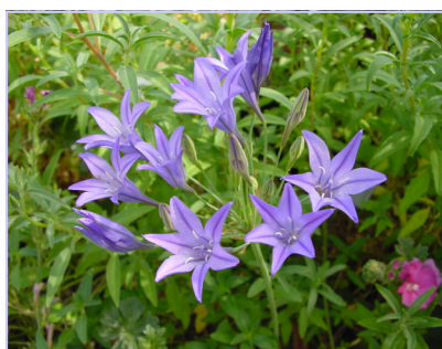
Ithuriel's Spear ( Triteleia laxa)