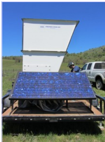
Mobile atmospheric profiling System