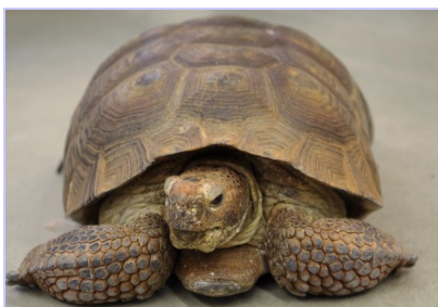
"Jeremiah" is a California Desert Tortoise ( Gopherus, agassizii )