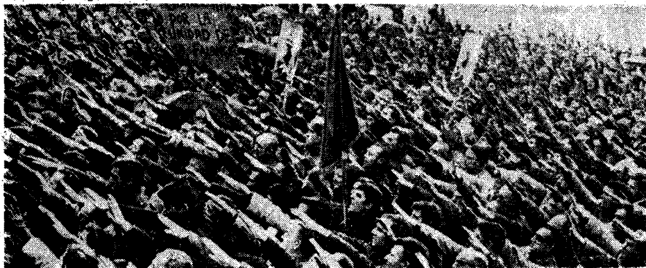
Nazi-like Falangists rendered their Nazi-like salute at their biggest political rally in years

And there, as here, the presence and persistence of British troops can be explained by many reasons, but essentially one fact: the British are imperialists. One characteristic of imperialists is their attitude that they're supposed to be everywhere, running everything. Another consideration is that Ireland is incredibly wealthy in minerals: gold, silver, copper, coal, and off-shore oil. (English are nuts on the subject of oil, since they live in constant fear that their oil supply from the Arab countries will be cut off.) And lastly is the fact that it is the nature of the perverted mind of the imperialist not to get out anywhere, if he doesn't have to.