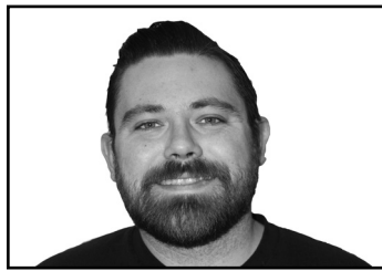
DAVID TAUB STAFF WRITER

Hecklers should really sit down, shut up and just enjoy the show