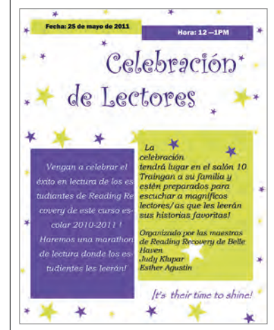
Figure 2. Spanish translation of the year-end Reading Recovery/DLL celebration flyer

On the special day, everyone gathers in a room at the school and Reading