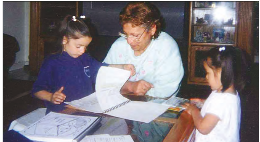
A Descubriendo la Lectura student works at home with her grandmother and younger sister.