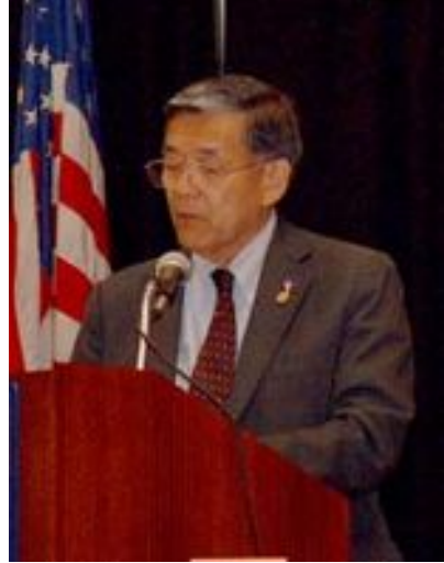
Fig 2: Norman Y. Mineta, Secretary of Transportation

“Think about how difficult it would have been for you to get to school or back home or to your favorite shopping mall, if we didn’t have safe and reliable forms of transportation,” asked the Secretary.