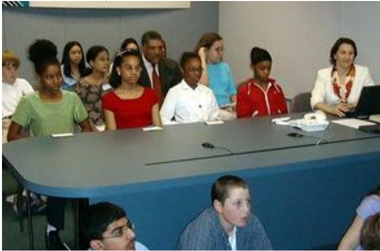
Figure 3: Jones Middle School Students in Hampton Roads, VA.