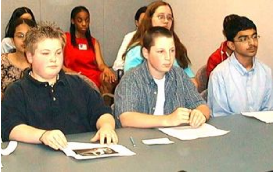
Figure 1: Students at Jones Middle School in Hampton Roads, VA. listen to a presenter via videoconference technology