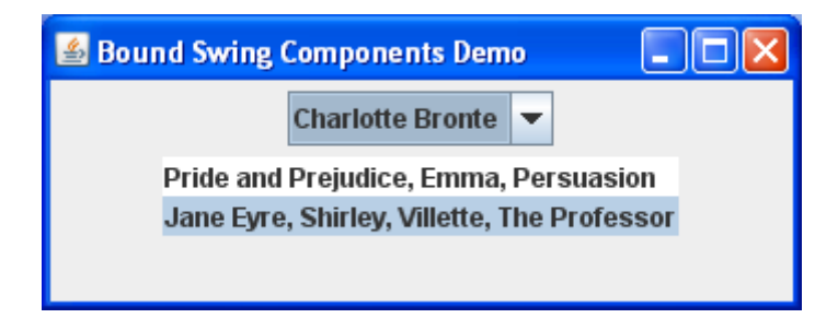
Figure 2. Screenshot of Swing component binding demo

The bind feature is added to existing Swing components by creating extension classes that contain the added functionality. JavaFX also, has its custom UI classes created on top of Swing components to provide extra functionality. The code for my BoundJTextField, an extension class to JTextField is given below.