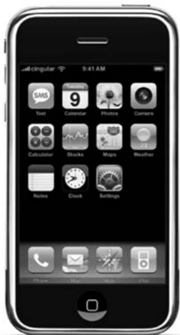
An iPhone and its apps

Evaluating iPhone Apps. When exploring what iPhone apps can be adapted for use in library settings, evaluation criteria should be applied. Price is not an important issue—many apps are free or are priced at less than $5, which offers good value. Memory requirements of apps are a consideration though, especially with an older iPhone model such as the 8G. Criteria to consider include the following: