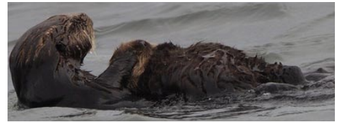
Look closely to see this otter pup cruising on his mother's tummy. See more on Page 7.

A Newsletter of the San Jose State University Emeritus and Retired Faculty Association