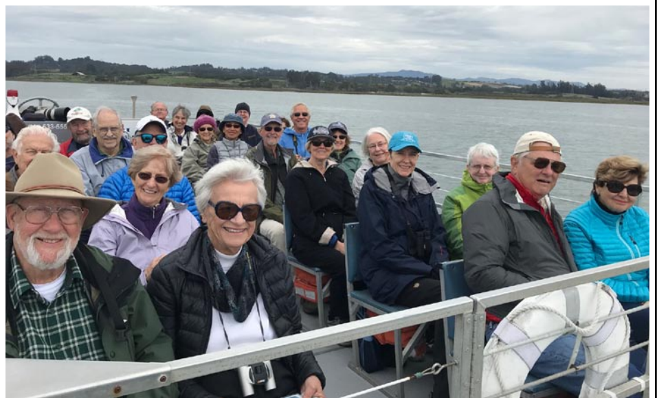
One of our two ERFA groups embark on a boat tour of Elkhorn Slough to see the wild life up close and personal.