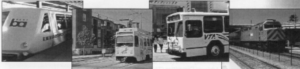
The MIS will compare alternative modes including BART, light rail, express bus, and commuter rail.

are critical components of the MIS. The major steps in the MIS process include: