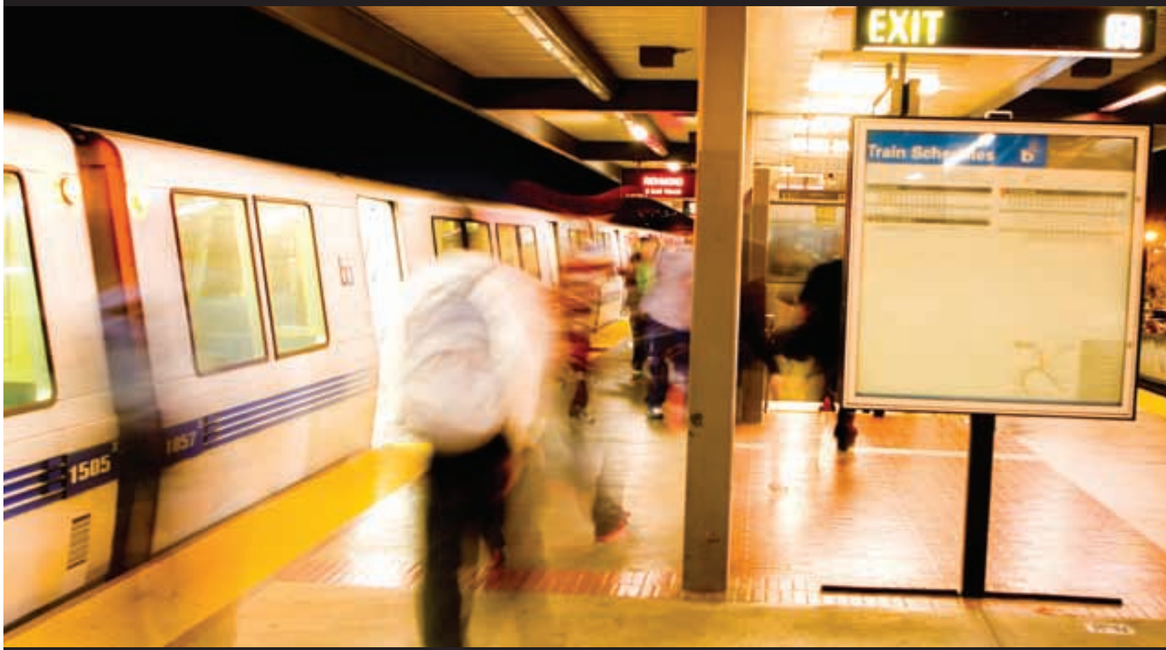
The platform of the Fremont BART station.