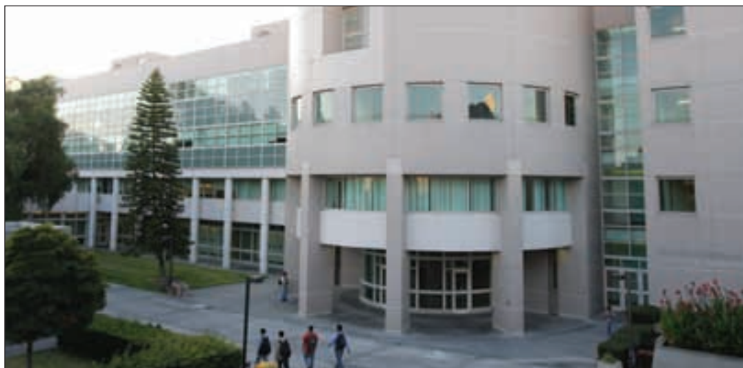
The Charles W. Davidson College of Engineering Building.