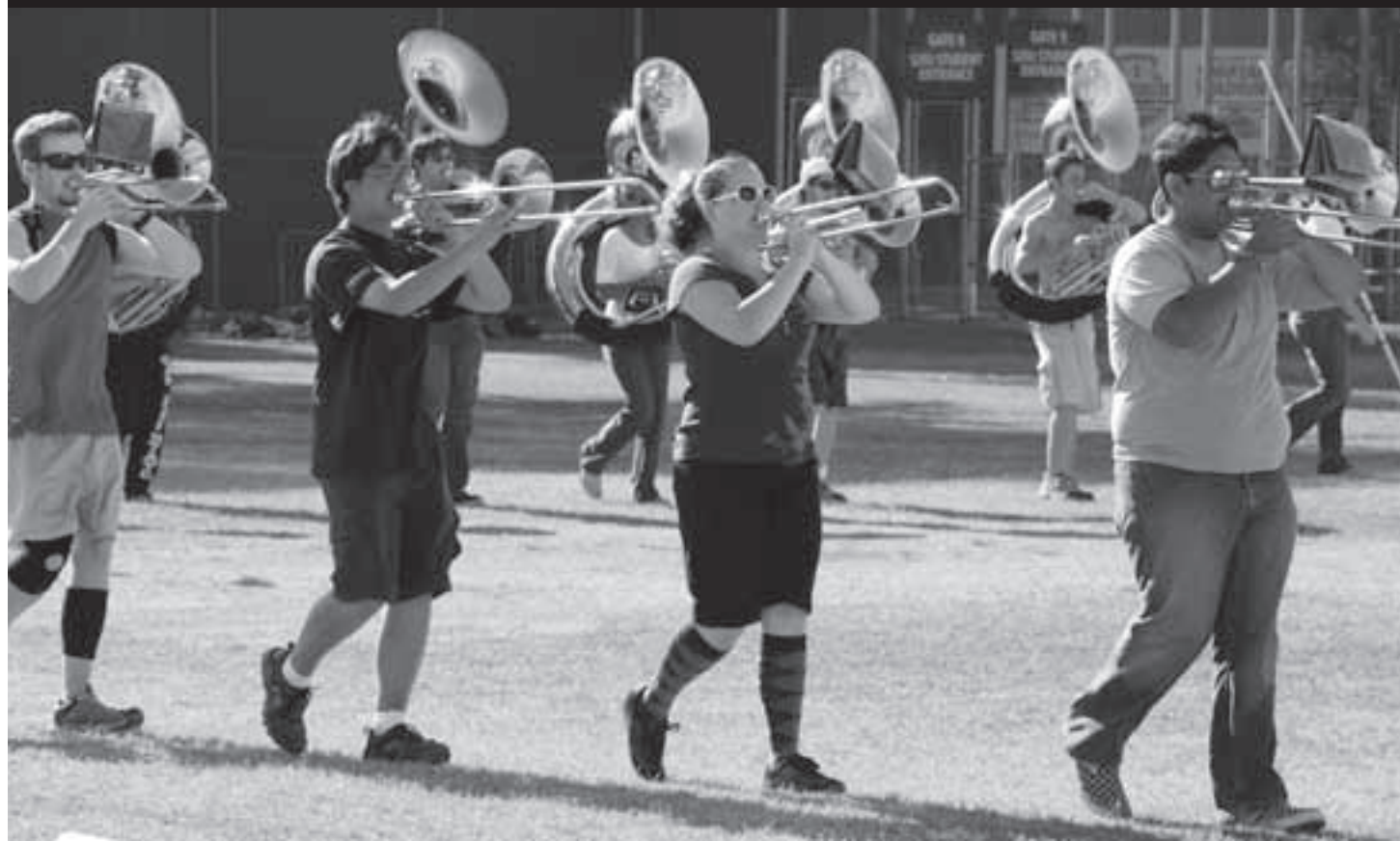
SJSU band practice at the Spartan field for the SJSU vs. Stanford game.