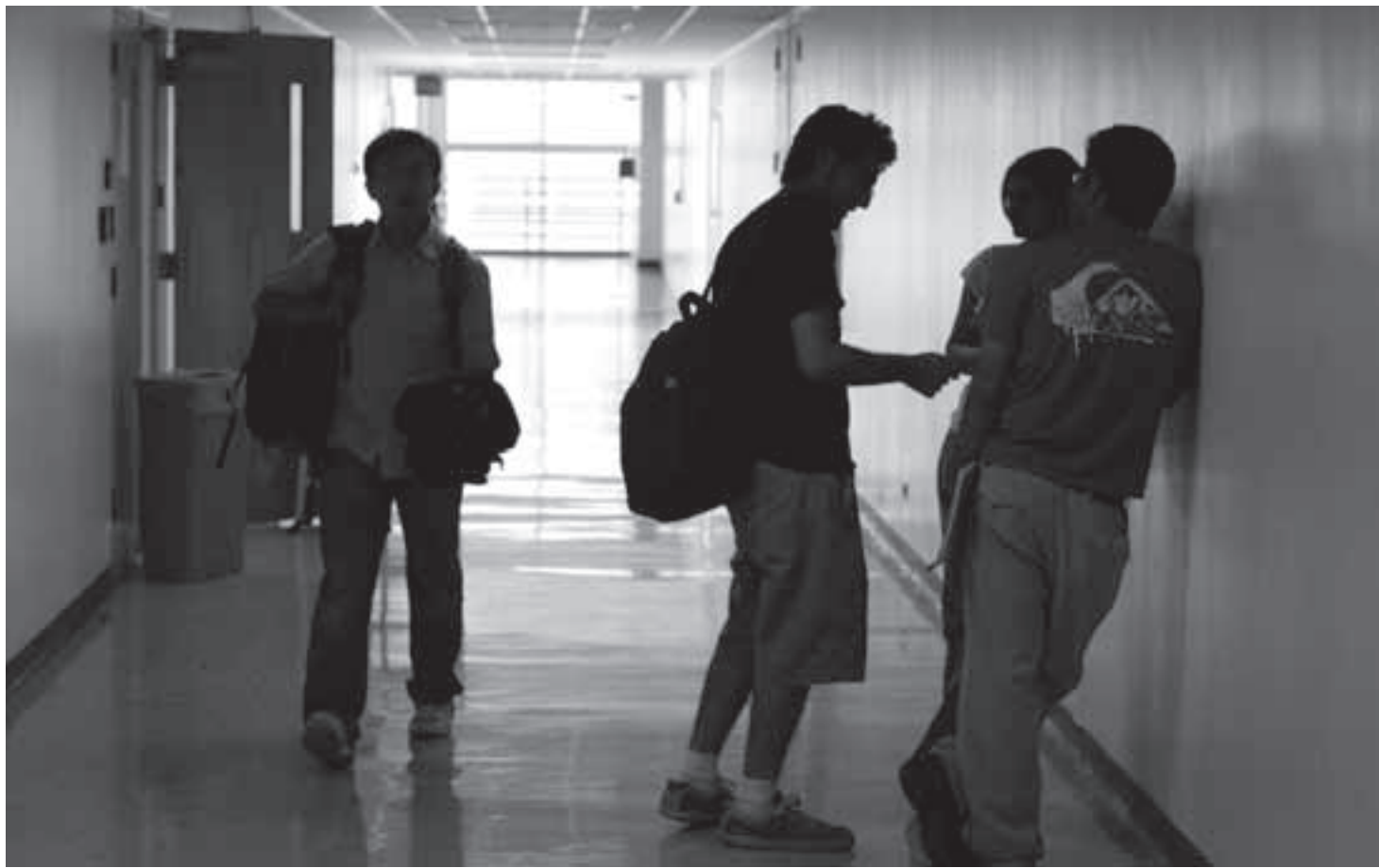
Computer science students converse in a College of Engineering hallway.

Go to spartandailynews.wordpress.com or spartandailysports.wordpress.com