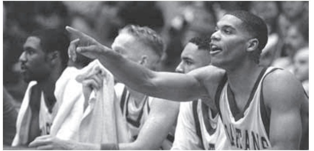
Tariq Abdul-Wahad, then known as Olivier Saint-Jean, played basketball at SJSU during the 1996-97 season.

Tariq Abdul-Wahad, also known as Olivier Saint-Jean, entered the National Basketball Association as a first-round draft pick after playing basketball for the Spartans and has entered the hall of fame while attending SJSU as a graduate student in art history, accord-