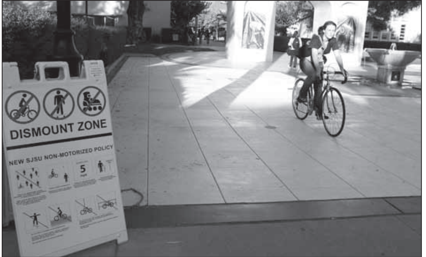
A student passes through the dismount zone near the Cesar E. Chavez Monument.