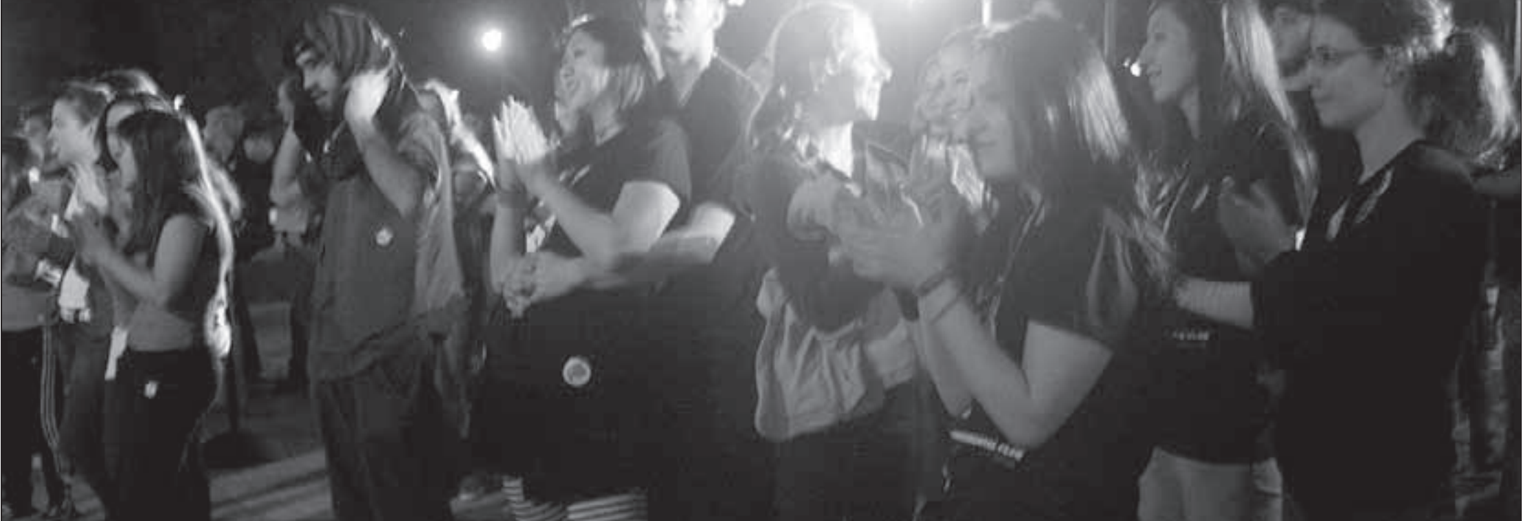
Students attend the Rock for Higher Education Concert on Thursday at the Campus Village Courtyard. The concert was meant to bring awareness and interest to budget cuts going on throughout California.