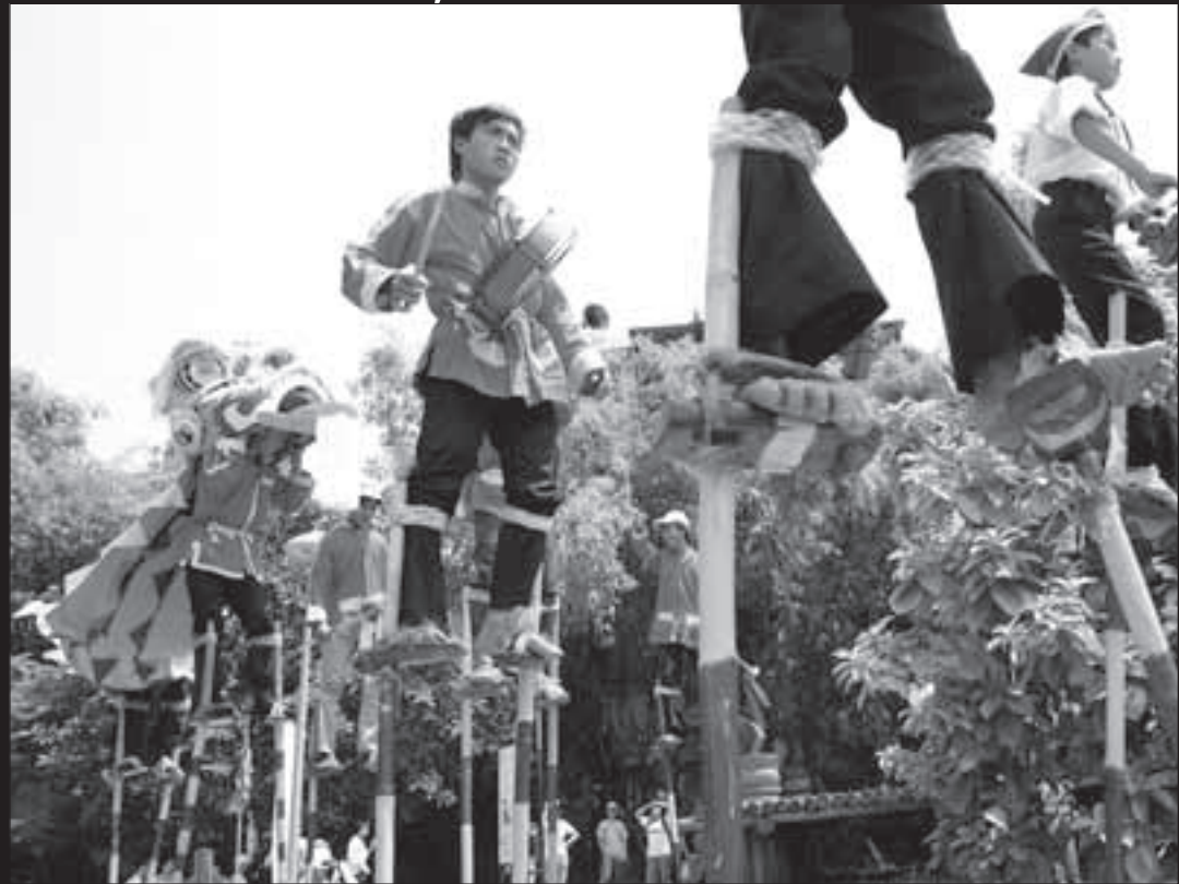
Nam Dinh Province performers dance on stilts as part of the Mid-Autumn festival at Vietnam Museum of Ethnology in Hanoi, Vietnam, on Sept. 22, 2007.

In the U.S., the most popular Vietnamese food is pho. There are a number of pho-noodle restaurants in San Jose alone.