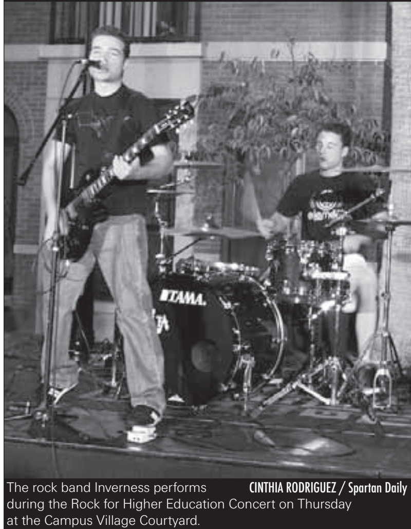
The rock band Inverness performs during the Rock for Higher Education Concert on Thursday at the Campus Village Courtyard.