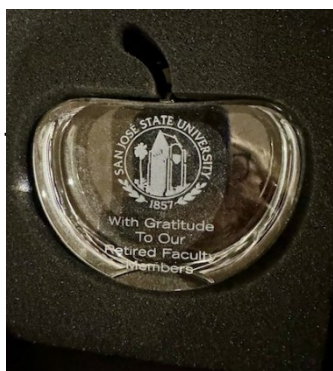
Honorific plaque... a memento for retiring faculty