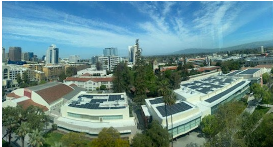
View from the 8th floor of the ISB