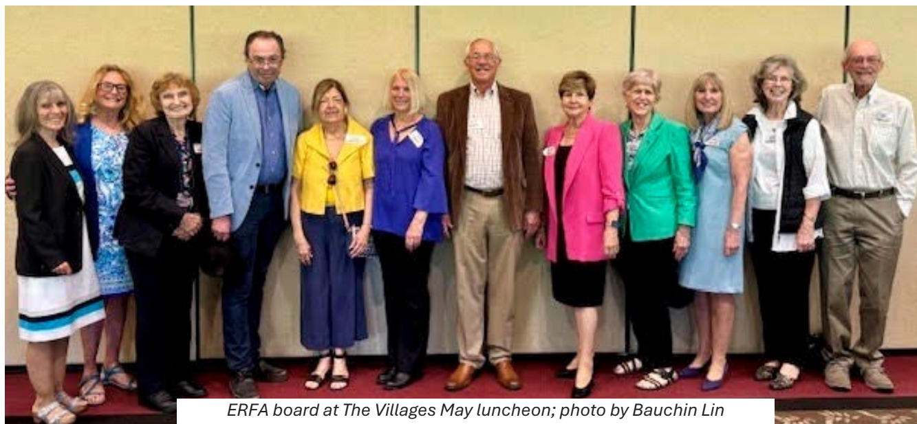
ERFA board at The Villages May luncheon; photo by Bauchin Lin