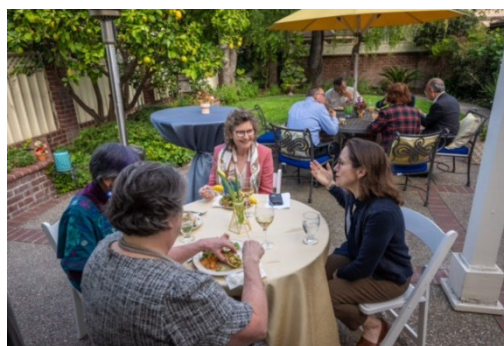
Newly retiring faculty enjoy a reception at University House in their honor