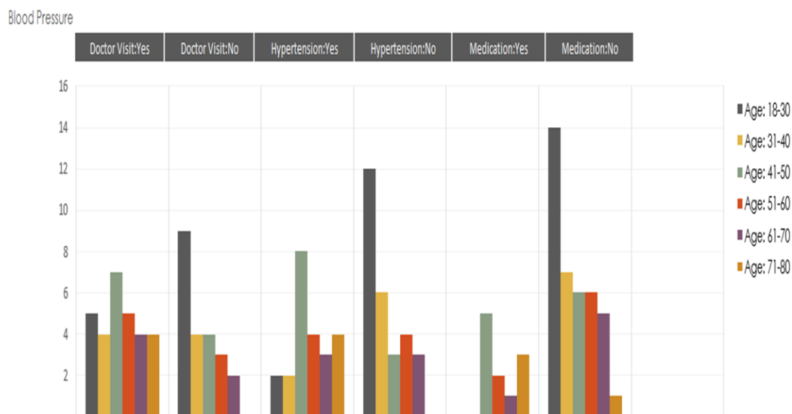
Table 1. Doctor Visits, Hypertension, and Medication by Age

Question BPQ.020 asked participants if they had ever been told by a health professional that they have hypertension, also known as high blood pressure. The results were that 46% of the participants answered yes and 54% answered no (see Table 2).