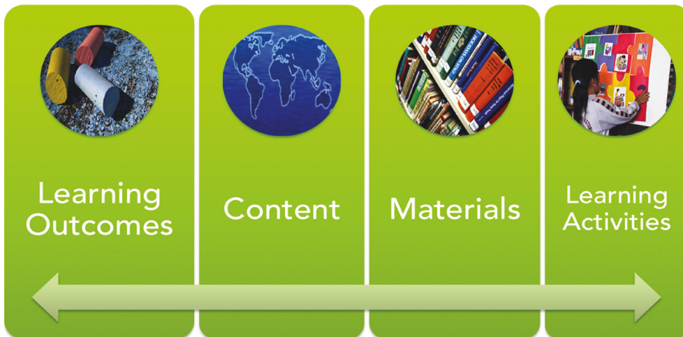
Figure 1. Course Components in Internationalized Curriculum. Course components for internationalized curriculum. Adapted from Helms, R., & Tukibayeva, M. (2014). Internationalizing the curriculum, part 3 . American Council of Education. Retrieved May 18, 2015 from http://www.acenet.edu/news-room/Pages/Intlz-in-Action-2014-March.aspx .

tution as to its local definition and implementation. Recognizing the need for that kind of support and to help faculty begin thinking about how to address the internationalization requirement in their courses, LWB and the iSchool collaborated to offer a one-hour web workshop called “Strate-