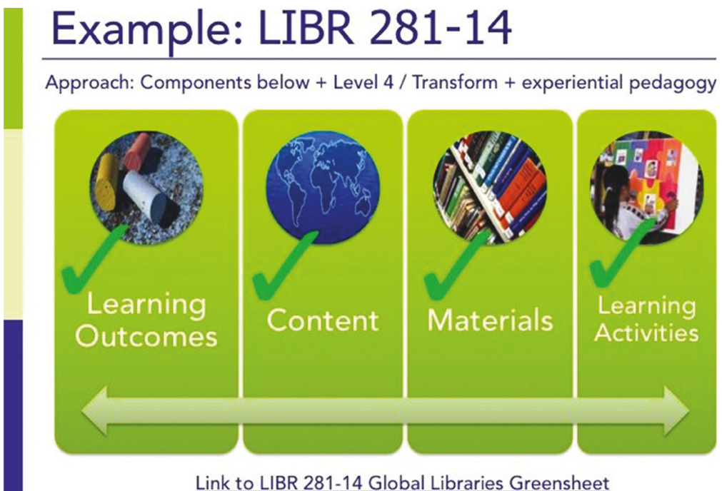
Figure 4. Model for iSchool/LWB Course: Examination of Global Library Issues Using Project Based Learning. As a result of the SJSU iSchool and Libraries Without Borders workshop and the models proposed by Helms and Tukibayeva (2013) and Sheryl Bond (2003), a new course was developed “Contemporary Issues: Examination of Global Library Issues Using Project Based Learning”. See also http://ischoolapps.sjsu.edu/gss/ajax/showSheet.php?id=6514 .