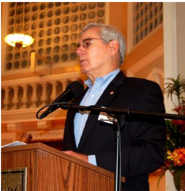
Figure 1 MTI's Executive Director Rod Diridon, Sr.

This is the second in a sequence of national transportation policy summits on bicycle safety; the first was a year ago. The summits have been specifically requested by the leaders of the congressional transportation committees. The transcript of these proceedings will be provided to those legislative leaders and will be the input device for a study on this subject, and bicycle transportation safety in general, that's being conducted by the Mineta Transportation Institute.