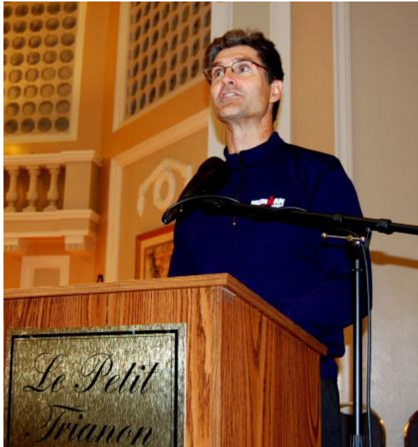
Figure 2 Keynote speaker Carl Guardino

light-rail trains for bikes. Some of that funding was through that funding source. Those are the types of policies that transit providers can and have taken advantage of to make sure there's room for all types of commuters as we extend that first and last mile. I really take advantage of that, especially on rainy days. I can jump on light rail near my office, get off at the Winchester station in Campbell, and ride the rest of the way to and from my home. That is a great amenity, made incredibly easy by the Valley Transportation Authority, so kudos to them.