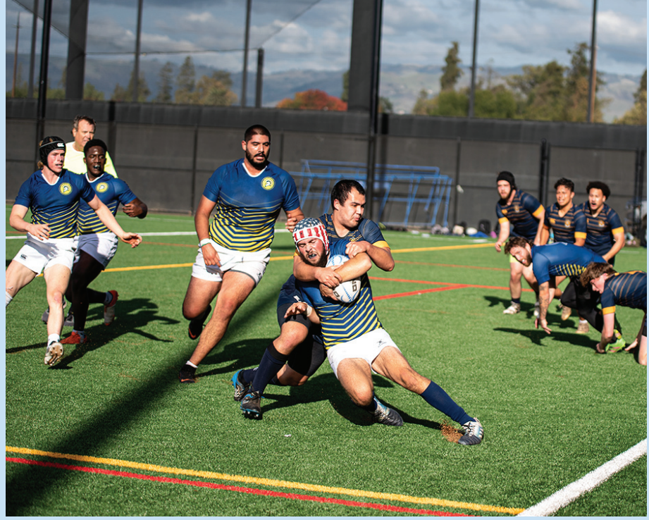
Left: A Banana Slugs defender attempts to tackle Spartans rugby club team member during a game at South Campus Recreational Field Nov. 6.

Right: Teams lift jumpers in a move called "line-out" in which a play restarts after the ball has gone out of bounds.