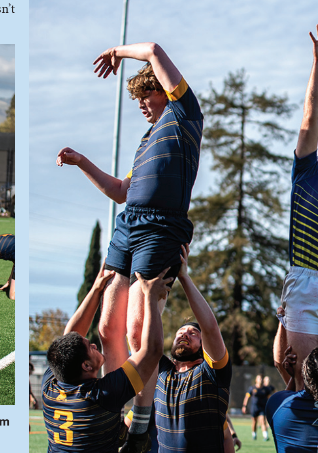
The men's rugby club team scrums the ball in a game against UC Santa Cruz.