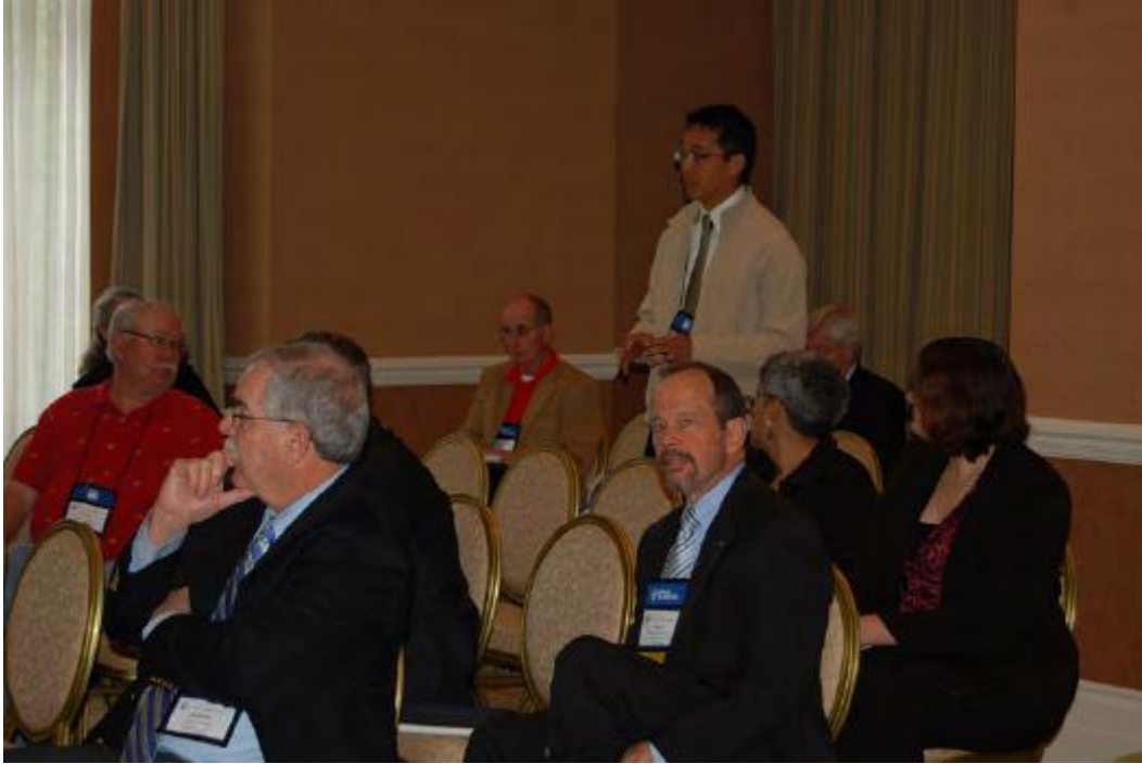
Figure 5 SuperSession Attendees

and keep the rider in mind as much as possible.