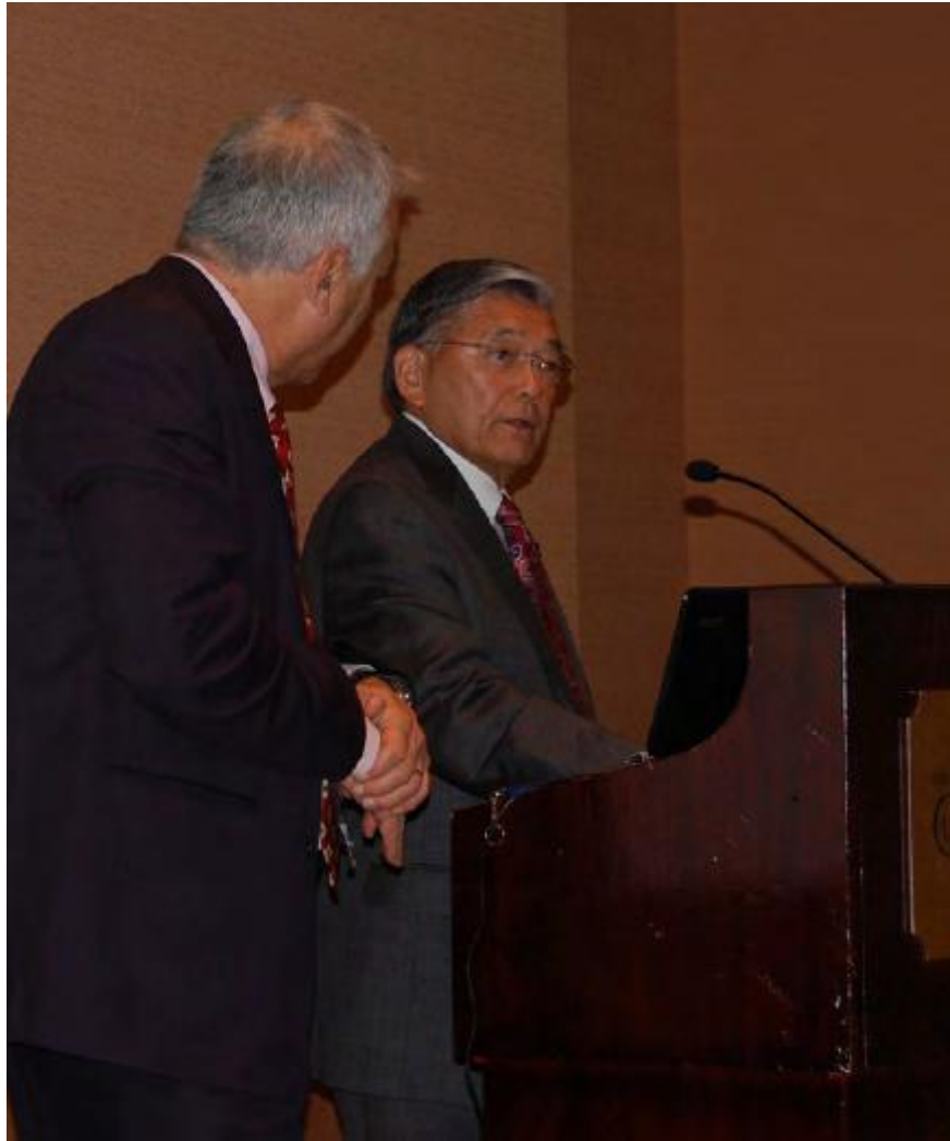
Figure 1 The Honorable Norman Y. Mineta During Introductions

question that we are very fortunate to have a group of people who are dedicated in terms of their professionalism and who are willing to serve in a public-service capacity across the country.