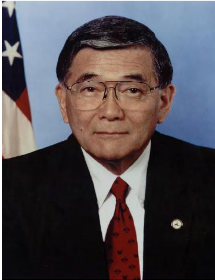
Figure 8 The Honorable Norman Y. Mineta

A native of San José, Secretary Mineta first served in elected office as a member of the San José City Council from 1967–1971 and as mayor from 1971–1974, becoming the first Asian American mayor of a major U.S. city.