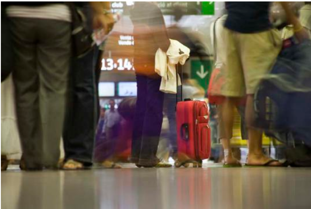
Figure 11. A Barcelona Metro Station