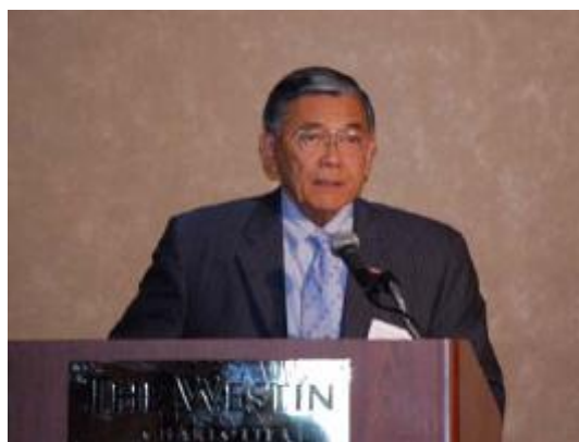
Figure 13 The Honorable Norman Y. Mineta, Former Secretary of Commerce and Secretary of Transportation, Hill & Knowlton Vice Chairman

A transportation policy summit is not exactly the way most people would probably want to spend a typical Saturday, and yet we know from the discussion of the panel this morning, as well as what Senator Plymale said, that these are not typical times. And, as we've been hearing today, a rank-and-file crisis is brewing, and it's going to take the collective will of everyone to figure out a solution. In spite of this, I know that we can and will succeed.