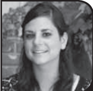
CALLI PEREZ Staff Writer

What would be the point in burning a large quantity?