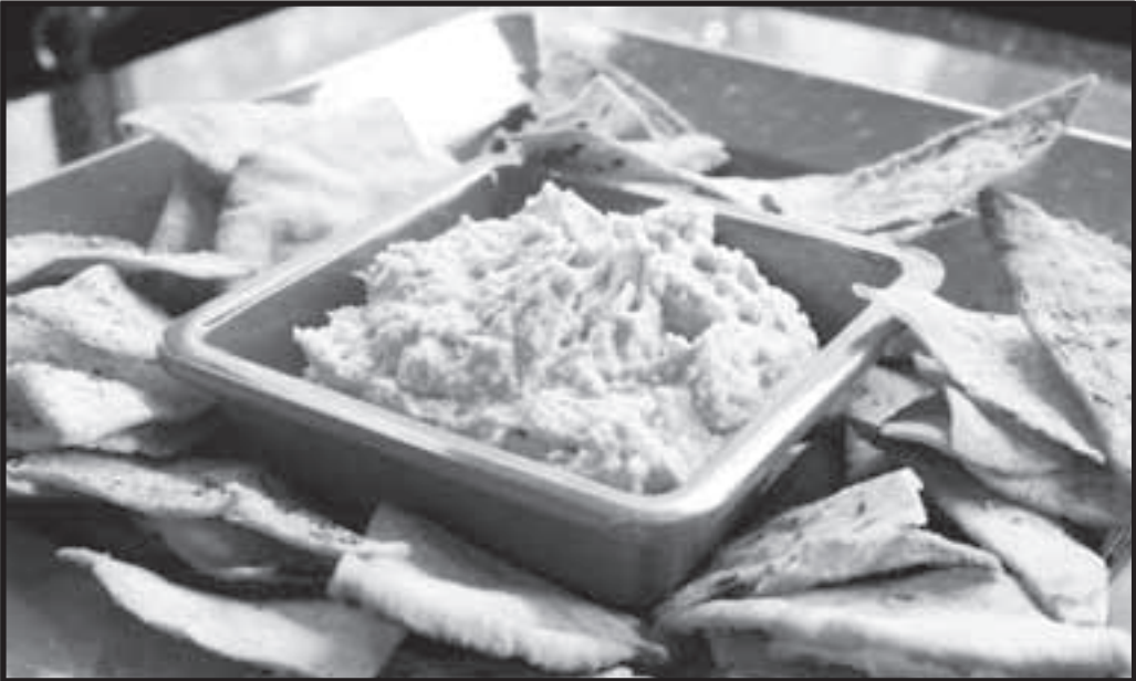
The pita chips and hummus side dish offered at Ruffled Feathers Eatery.