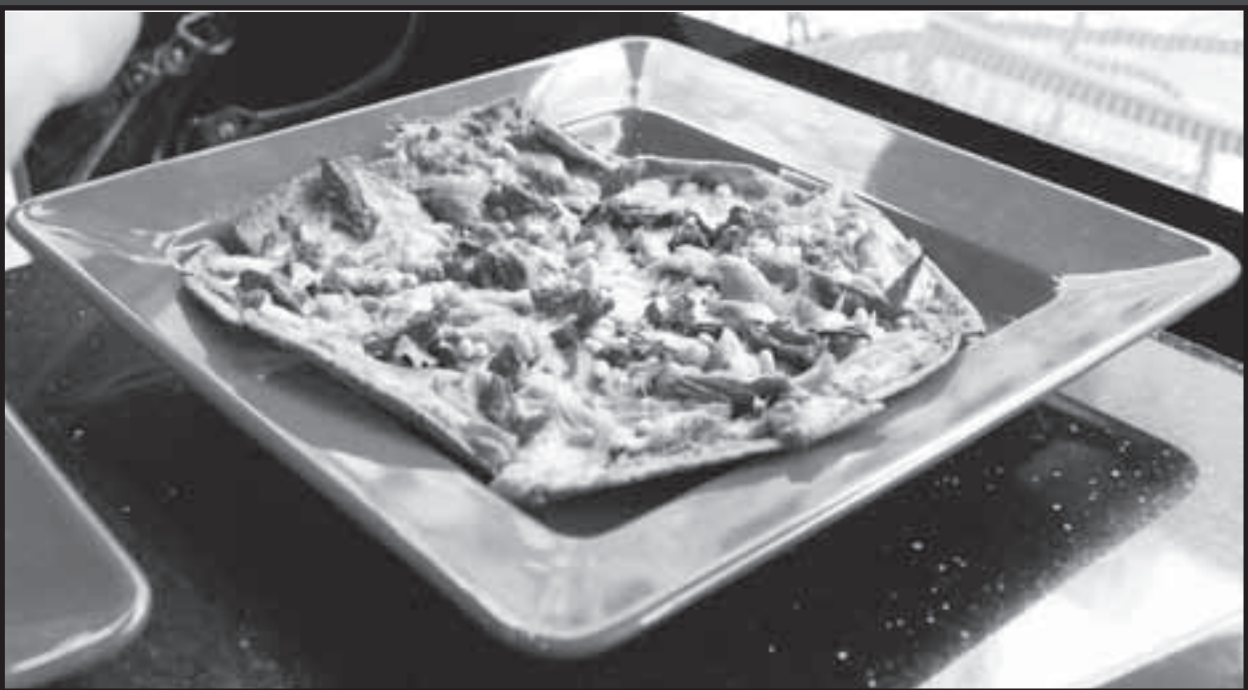
The Eatery Pitza is made on a pita bread instead of pizza dough at Ruffled Feathers Eatery.

Students who are growing tired of the limited food options on campus might find reasonably priced and healthier options at Ruffled Feathers Eatery for a change of pace.