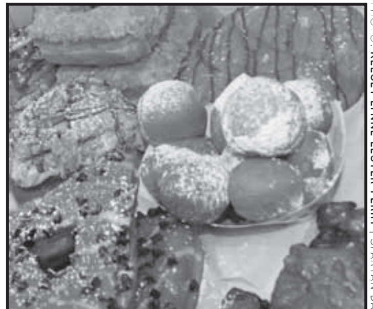
"Psycho Donuts" have creative shapes, sizes and fillings.