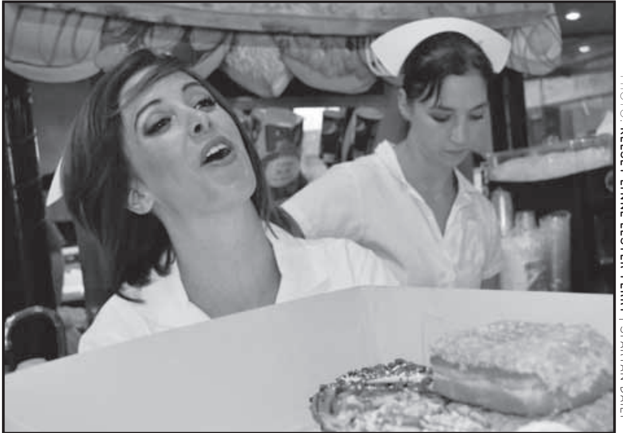
A nurse at "Psycho Donuts" on 2nd and San Carlos Streets, boxes up a customer's order during its grand opening on Sept. 16.

"Things are picking up really fast," she said.