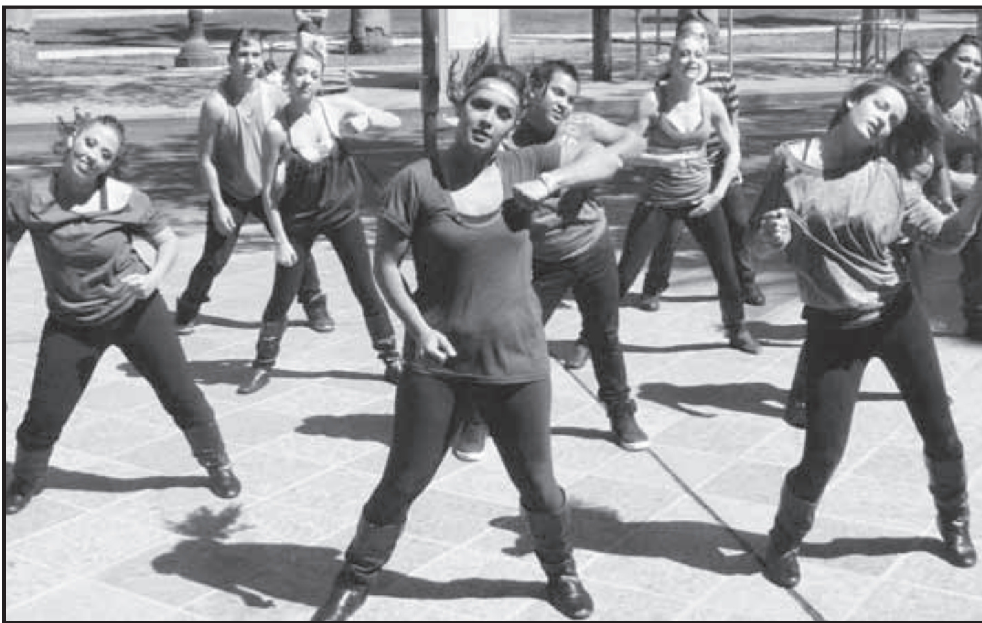
Members of the Soul Con dance group perform in front of the court house in San Jose as a part of 'Dance in Transit' on Sept. 18.

"I'm hoping that in taking a step back, not cutting corners and being really diligent about the way we fund and plan it this year, that in the coming years, I'll be able to create again," she said.