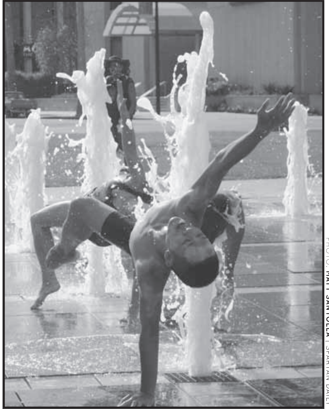
Members of Necrocosm perform during 'Dance in Transit' festival in the fountains at Plaza de Cesar Chavez on Sept. 18.

"Beyond that, it was just really the two of us pulling together and making it happen,"