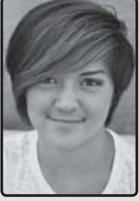
Sophomore Graphic Design

I don't know much about it. I know that they have a bunch of recycling bins all over campus, but I don't know how extensive their recycling program is here.