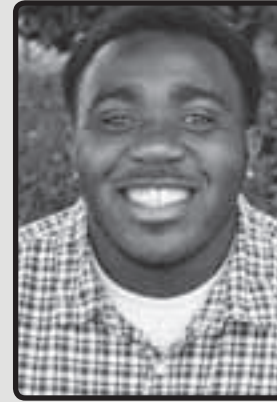
Senior Health Service Administration

I feel like they are improving. Of course there are always areas that need improvement too, so it is a progressive struggle. They need to put out more trash bins and recycle bins.