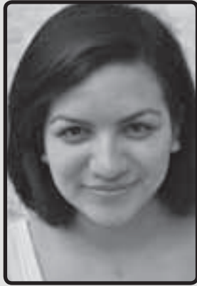
Sophomore Business Management

I think they are doing a pretty good job. There are recycle bins around campus but there is always room for improvement.