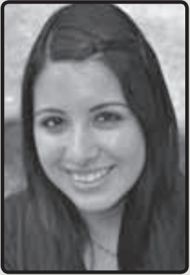
Sophomore Management Information Systems

I think we should all recycle more because we need to help the environment. We are having a lot of global warming issues and I think SJSU is doing its part but we need to increase the effort they are already making.