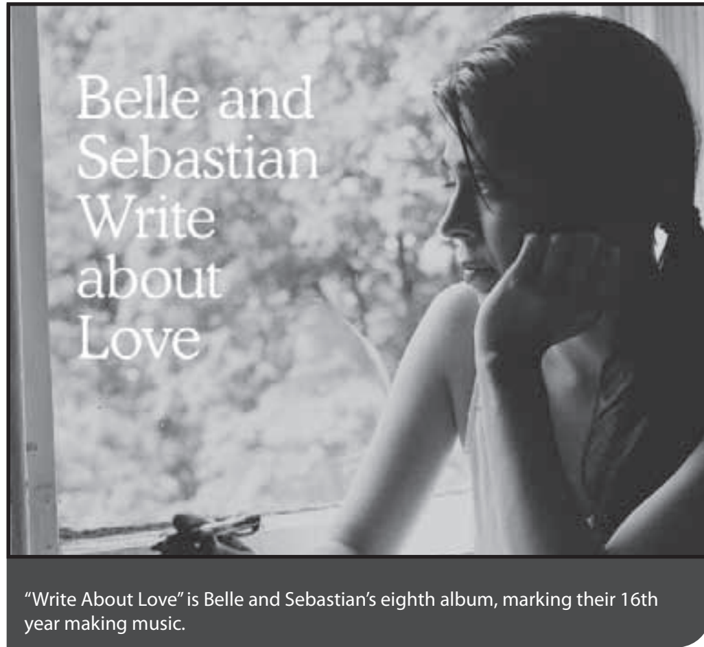
"Write About Love" is Belle and Sebastian's eighth album, marking their 16th year making music.

For me the allure of the band and the reason I have consistently been a fan of Belle and Sebastian album after album, is because the band isn't striving to break barriers or reaching new heights with its music. The band seems content to simply share its plaintive reflections about the game of life one con-