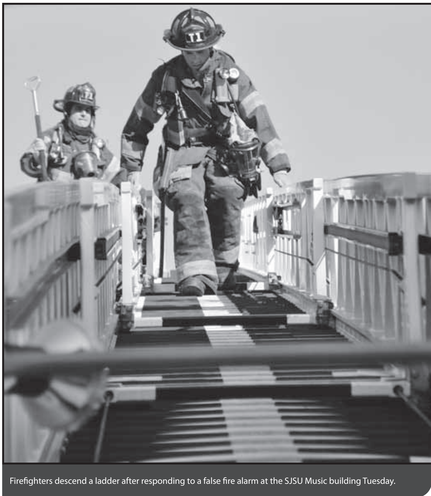
Firefighters descend a ladder after responding to a false fire alarm at the SJSU Music building Tuesday.