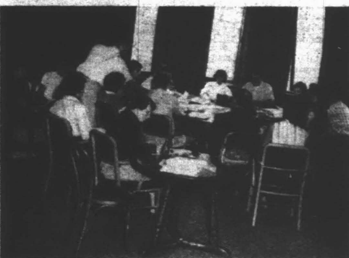
STUDENT GOVERNMENT—Hard at work managing San Jose State student affairs is the 13-member Student Council. Student body officers and class representatives meet each Wednesday at 3:30 p.m. in the Student Union to discuss business.