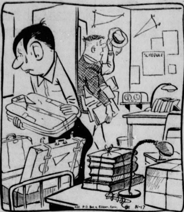
"SAY, THOSE WERE PRETTY TOUGH 'FIRST DAY' ASSIGNMENTS, HUH?"