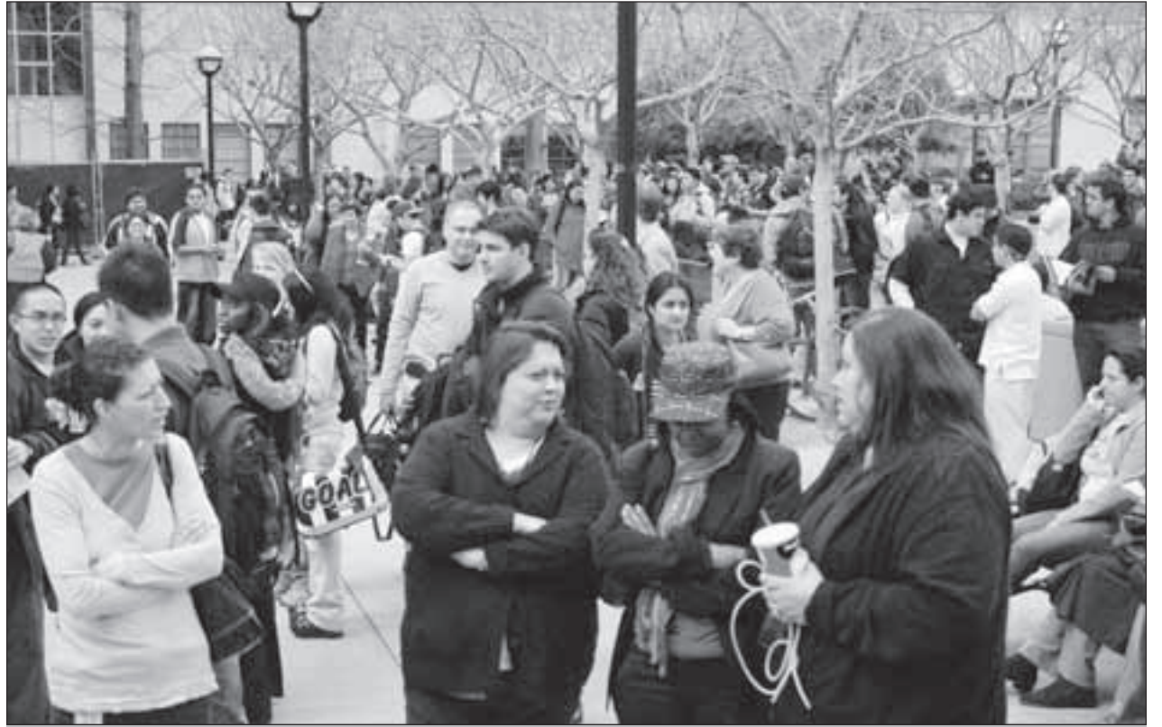
Nelson Aburto / Spartan Daily