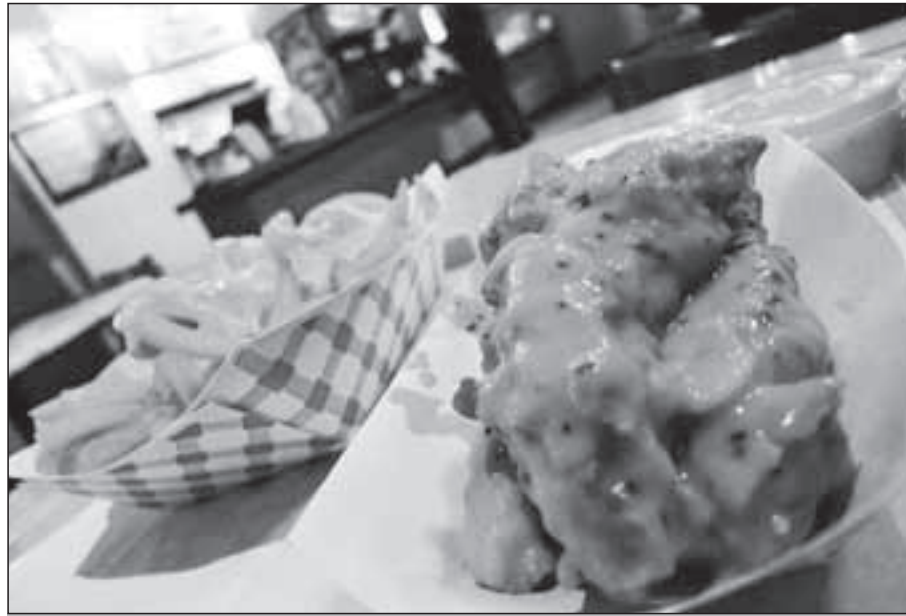
The cheesy curly fries and chicken tenders covered in "Atomic" sauce from SmokeEaters located on 29 S. Third Street.