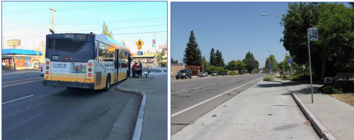
Figure 4. Bus Bulbout (left) versus Bus Turnout (right)