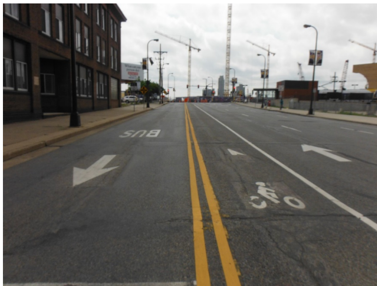
Figure 6. Allocating Roadway Space to Multiple Modes in Downtown Minneapolis

Transit vehicle operations are one of many transportation functions that need to be incorporated into the city streetscape. There are competing interests in the use of roadways between cars, bicyclists, pedestrians, buses, streetcars and light rail, and even more competition for use of curbside space. The allocation of space among these competing interests is in the purview of the roadway owner, i.e., city, municipality, county or state. When the responsibility for providing transit service lies with an "outside" agency, that is, when it is not part of the city, county or state organizational structure, functions under city purview often receive priority at the expense of transit. A transit-friendly city, however, considers public transportation as an essential part of the total transportation network provided to the community and not a separate function. Thus, a transit-friendly city considers the needs of transit planning and operations just as they do all other modes, in all infrastructure and transportation planning activities. Consideration and implementation of the types of policies and practices identified in this report will help cities to do this.