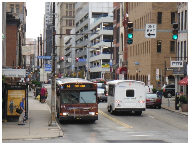
Figure 1. Bus on City Street in Pittsburgh