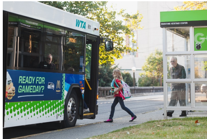
Figure 3. Bus Passengers in Bellingham, WA