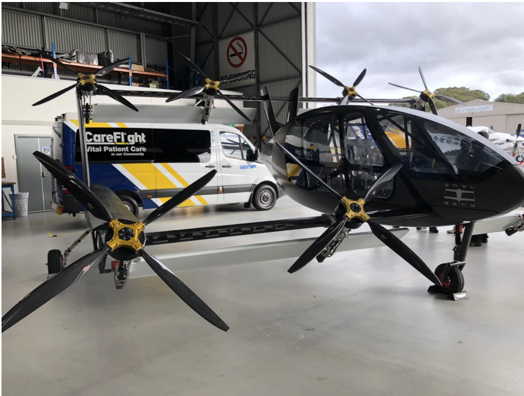
Figure 1. Electric Air Ambulance from AMSL Australia