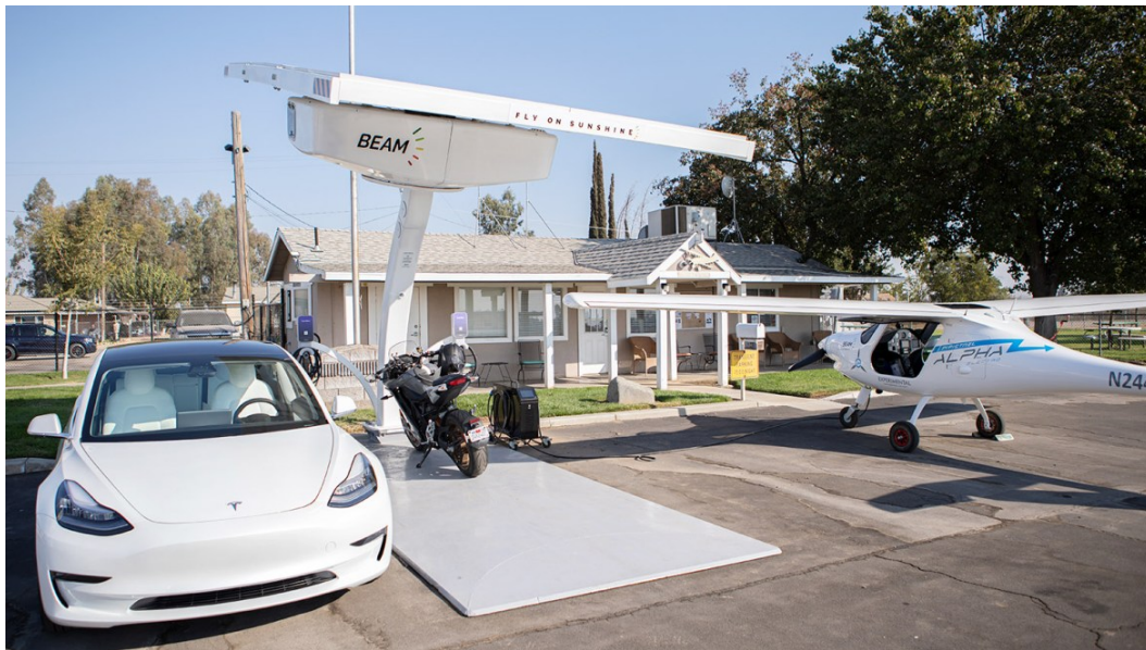
Figure 5. Beam EV ARC Charging Electric Aircraft and Car at Reedley, CA