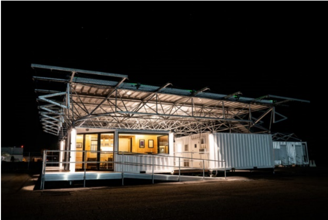
Figure 4. Modular Facility Electro Aero