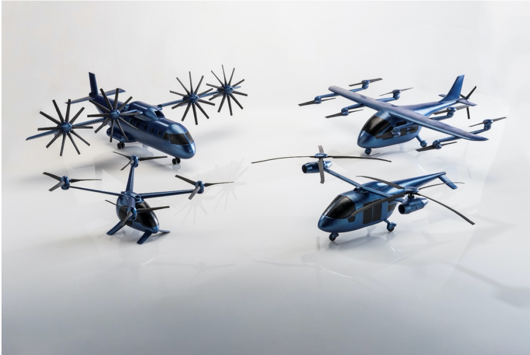
Figure 2. eVTOL Prototypes