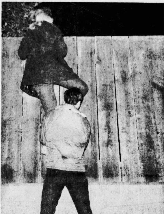
A COMMON dilemma: It's 10 minutes past lockout and this girl will certainly turn into a pumpkin if the house mother has locked the door. Even with the moral support of her boyfriend, her only hope is window tapping in order to obtain entry into the now time-locked domicile.

(NEXT: Faculty and administration opinion.)