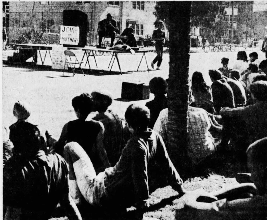
THIS WAS THE SCENE Saturday afternoon during Parents' Day, as a small group of students gathered to hear the demonstration scheduled by the Students for a Democratic

Police are unsure if the bomb was thrown or placed in the position where it went off.