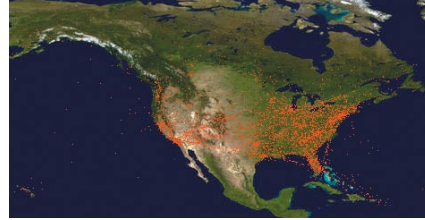
Map of civil (non-military) flights in U.S. airspace at a given moment.

After developing their optimization model, Drs. Wei and Corker will conduct a case study at the Dallas-Fort Worth