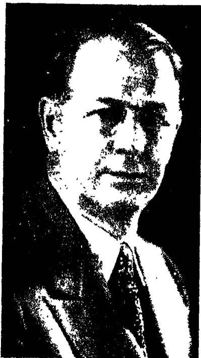
COLONEL FRANK KNOX

Principal Speaker at Our General Session, October 16th