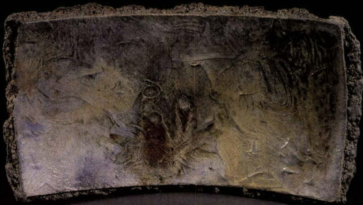
Below: Platter. 2006. 5.5 x 19 x 10.5 in.