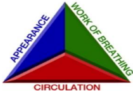
Figure A-1. Pediatric Assessment Triangle (Dieckmann, Brownstein, & Gausche-Hill, 2010, p. 313)

any position that will minimize stress on the child. Their initial response to any healthcare worker is a useful indicator of the extent of their illness. Infants will normally track and attune to noises as well as follow physical leads. Children up to 6 months will respond to typical cooing or tickling with appropriate responses, Children 7 – 24 months will show stranger and situational anxiety and look for comfort from their parents or caregivers. A thorough lung assessment is important and the nurse needs to utilize all tools to make an appropriate assessment. This could include a pacifier, toy or object for distraction. If the child does not respond along the continuum of expected behavior then this can be reflective of increasing severity of illness.